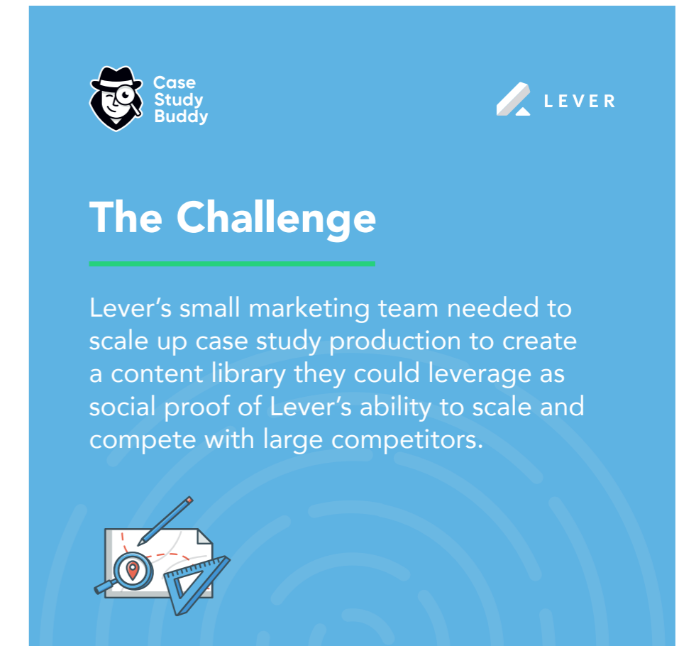
Body Copy slide